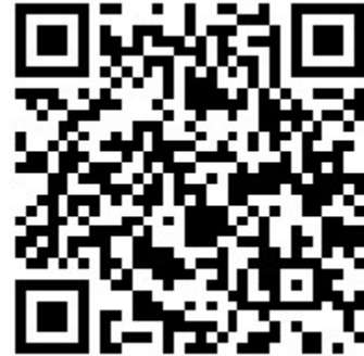
(Tigard Virginia Garcia website)